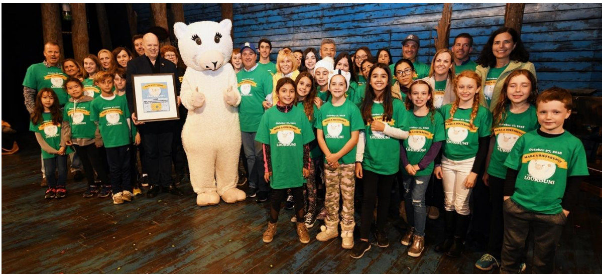
Pictured here: The Loukoumi Foundation presents a Loukoumi Make A Difference Award to the Producers of Come From Away on National Make A Difference With Loukoumi Day.

The Loukoumi Foundation has received the USA Weekend National Make A Difference Day Award, Tegna's Make A Difference Day All-Star Award and The Point of Light Award. Based on this project the Loukoumi Foundation sponsors The Make A Difference With Loukoumi Exhibit at The Westchester Children's Museum, a national literacy project benefiting St. Jude Children's Research Hospital and a Good Deed of the Month Curriculum in over 300 schools. The Loukoumi Foundation also sponsors its annual Dream Day contest making kids' career dreams come true for a day. The Loukoumi programs were featured in the Make A Difference With Loukoumi TV Special that aired on FOX stations nationwide. The Foundation is so honored to be teaming up with Come From Away , which tells the ultimate story of kindness, and with them looks forward to inspiring others to make a difference. For more on The Loukoumi Foundation please visit: www.LoukoumiFoundation.org